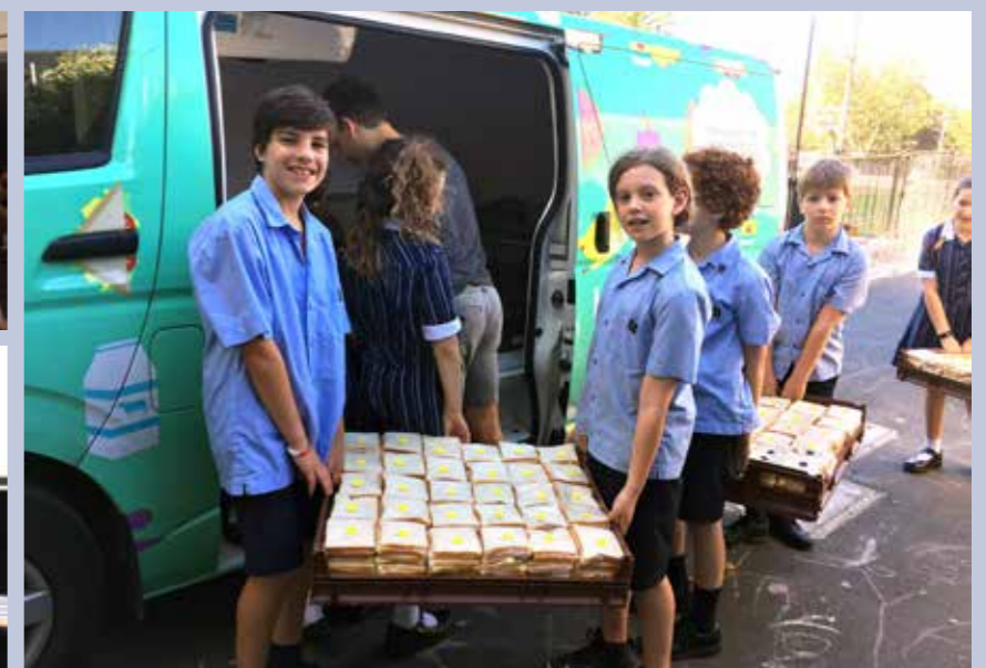
Year 5 student leaders assisted in preparing lunches for underprivileged students as part of the Eat Up initiative